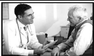
DOCTORS HOME VISIT